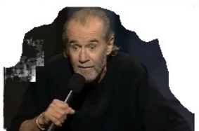
George Carlin – Context and Intent 14K views · 1 year ago

https://reference.bahai.org/en/t/se/UD/ud-627.html